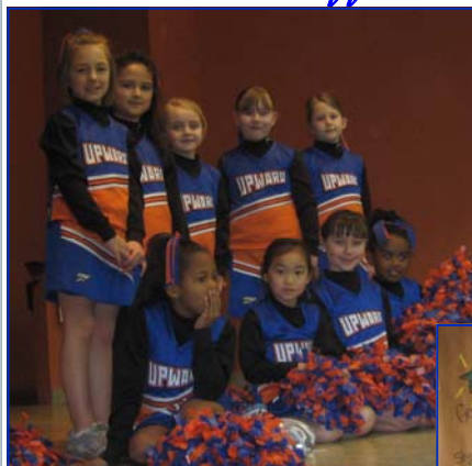
Upward Cheer 2010