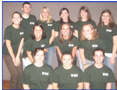
Students from St. Norbert College in De Pere, Wisconsin enjoyed pot-