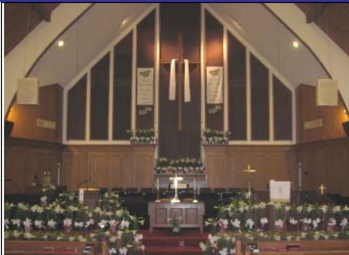
Highland Valley United Methodist Church Sanctuary Easter Sunday, 12 April 2009.