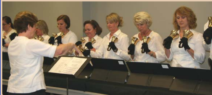
Left: HVUMC Handbell Choir playing "Hymn of Promise" for Crime Victims' Memorial Service, April 28, 2009 at Philander Smith College.