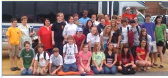
HVUMC Youth Choir tour departing Monday morning.

Please be in prayer for our Youth Choir as they travel this week to Dallas, Ft. Worth and Waco, Texas to share the love of God through Christ to those less fortunate. They began their tour Sunday afternoon at Methodist Children's Home, Little Rock, and departed for Dallas on Monday morning.