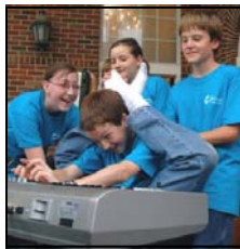
HVUMC Youth showing off in Dallas.