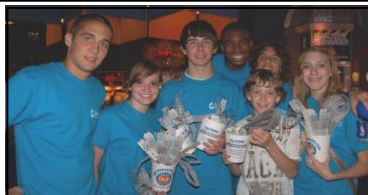
HVUMC Youth at Dave & Buster's in Dallas, TX.