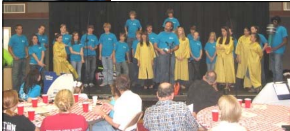
Potluck & Program at HVUMC, Friday, June 12