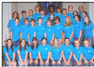
HVUMC Youth at Methodist Children's Home in Waco, TX