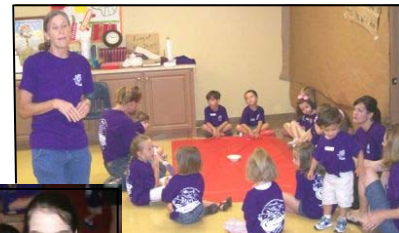
Pictured above and left: Scenes from VBS 2009.