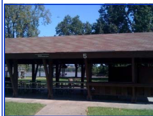
Maumelle Park Pavilion #5