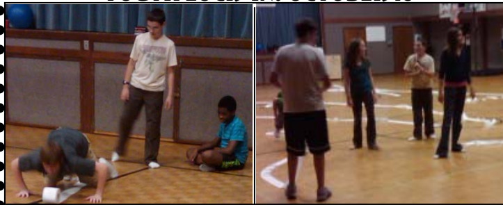
HVUMC Youth enjoying the lock in last Friday night.