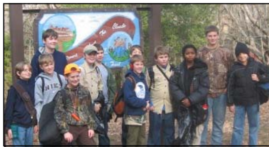
HVUMC Scout Troop 335 traveled to Mt. Nebo the weekend of November 13, 14 & 15. 12 Scouts and 9 adults were in attendance.