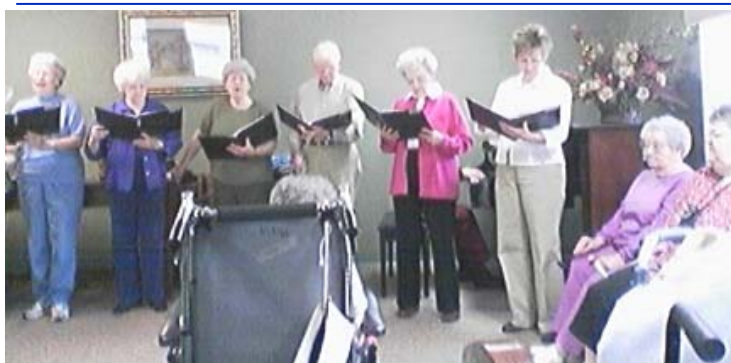
Grace Notes at Good Shepherd February 24