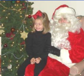
Santa visiting with several kids in the parlor on Sunday, December 7.