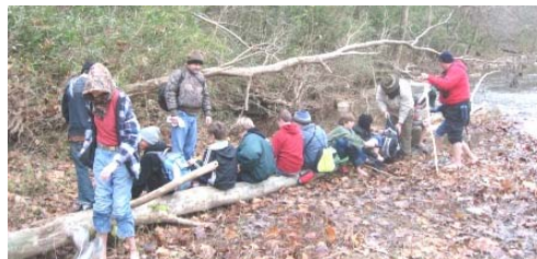
HVUMC Scouts safely to the other side.